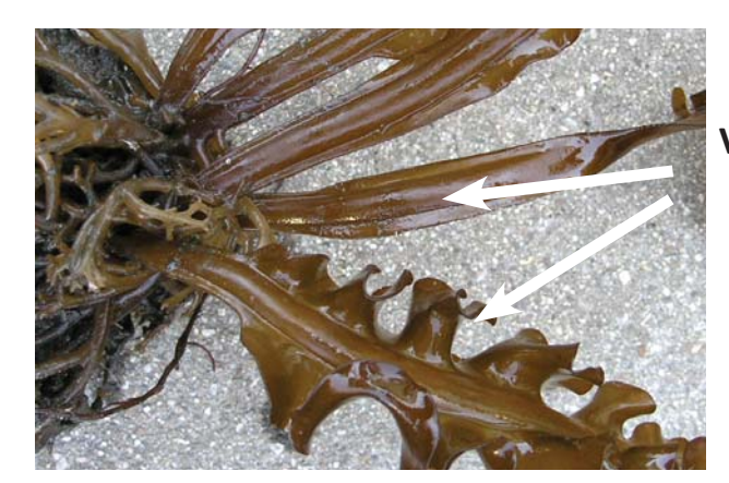
FLAT TO VERY RUFFLED NEAR BOTTOM (DEPENDING ON AGE)