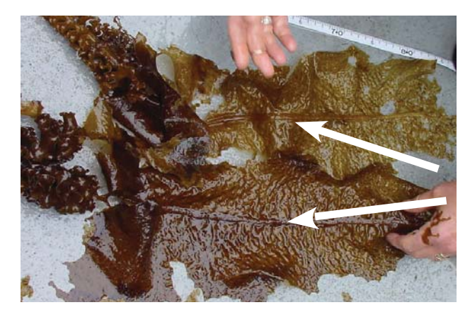
ID TIPS: SINGLE FLAT MID-RIB

The invasive kelp Undaria pinnatifida has recently been found on rocky reefs on the north side of Anacapa Island and it may be elsewhere.